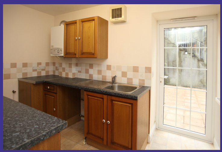
REF 1357 Modern and bright, unfurnished 1 bedroomed maisonette located within easy walking distance to shops and local amenities.